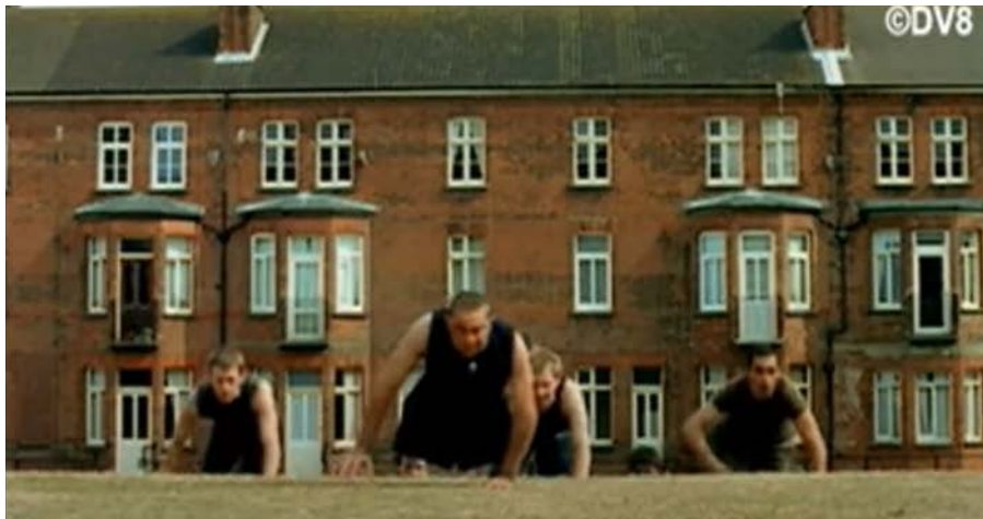
The cost of living , DV8 Physical Theatre, 2004 Lloyd Newson