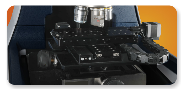
ContourX-200 motorized stage.