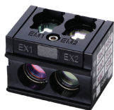
Easy-to-use filter system with magnetic filter cubes that can be swapped in a matter of seconds.