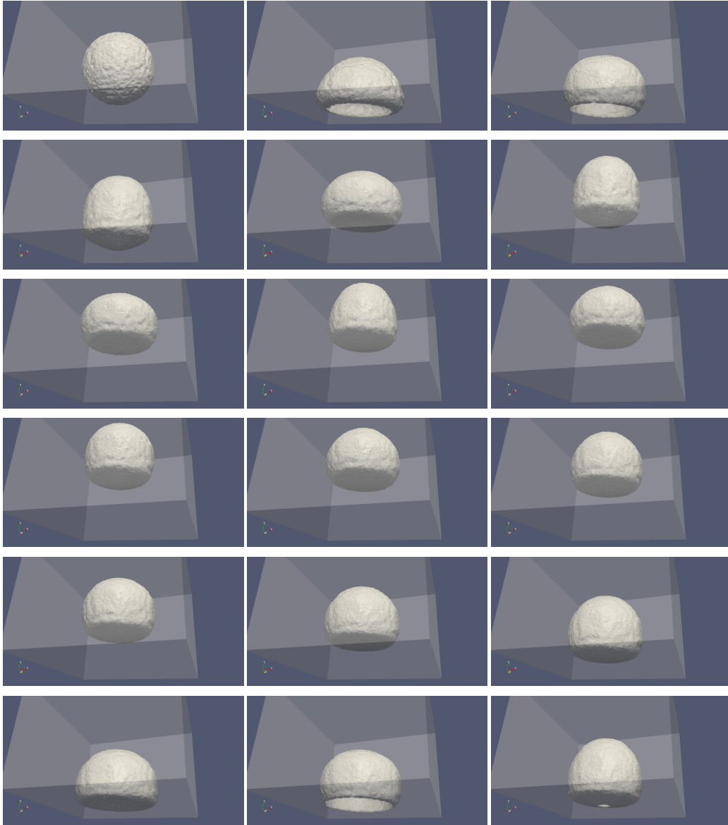
Figure 1. Ball bouncing. Shape of the deformed ball at time steps 3, 6, 9, ..., 54.