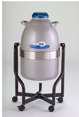
Trolley and tipping stand

Cylinders not equipped with wheels should be moved using purpose designed handling equipment. Trolleys specifically designed for transportation of both pressurised and non-pressurised vessels should be used. Some trolleys are designed with roller base-tipping enabling both transportation and safe pouring.