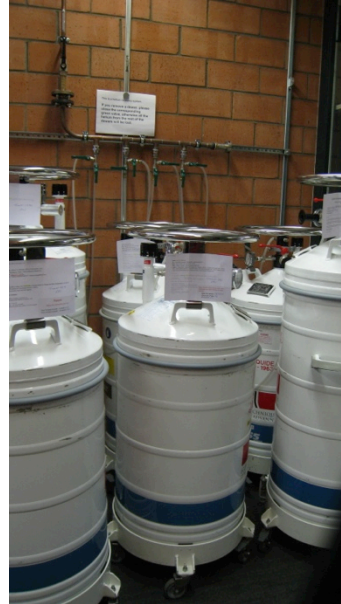
Indoor LHe delivery areas