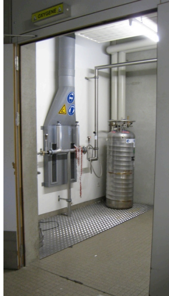
Indoor LN 2 dispensing areas