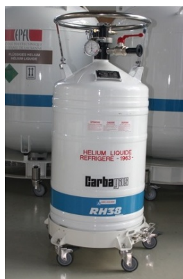
Pressurised liquid cylinders