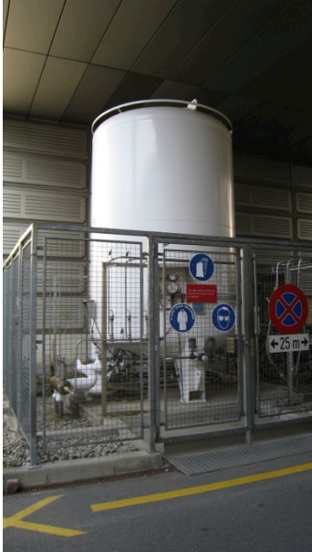
Outdoor LN 2 storage and dispensing areas