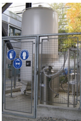
LN 2 static storage tanks