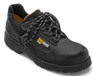
Re-enforced toecap shoes

Closed shoes should be worn to protect feet from spills and splashes. Boots are not recommended as they are more difficult to remove in case liquid enters them. If boots must be worn then trousers should be worn outside them to avoid the entry of liquid. Sturdy shoes with re-enforced toecap are recommended, particularly when displacing cylinders. Open toed shoes, such as sandals, must never be worn under any circumstances.