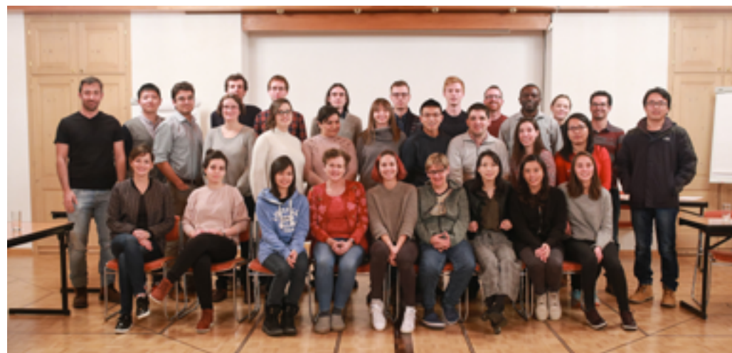
Ski Seminar 2018