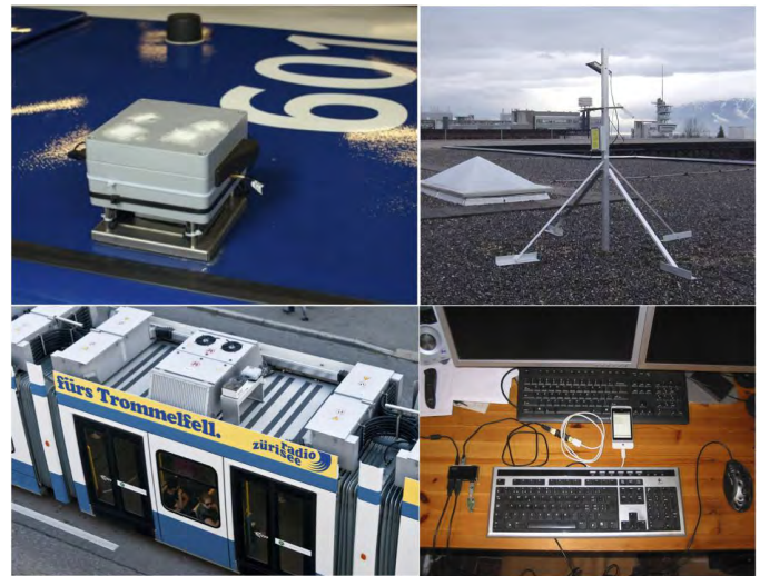
Fig. 1. Air quality sensors that could be used in community sensing. Top left: on top of a bus; bottom left: on top of a tram; top right: attached to a solar-powered weather station on a building; and bottom right: attached to a smartphone.

We are involved in a project that explores community sensing for measuring air quality using both fixed and mobile sensors. Examples are shown in Figure 1. Initial experiments with such sensors suggests that air quality varies significantly