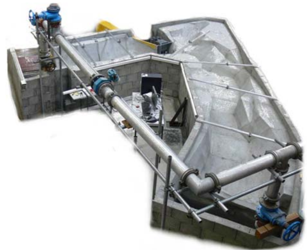
Figure 3 : Chespí model constructed in the laboratory with the two water supply pipes for river and reservoir ( Sc = 1:38 )