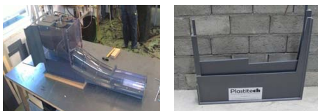
Bypass inlet and gallery