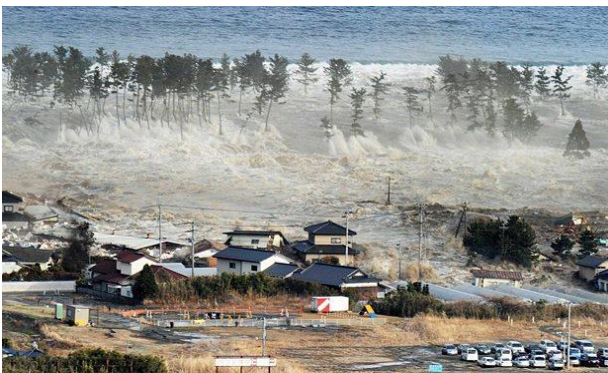
Figure 2 : Japan Tsunami 2011

Tsunamis are water waves caused by an earthquake offshore; they are characterized by long wave lengths and due to their low energy dissipation they can create flooding and destruction far away from the site of formation. Recent examples can be found in the Indian Ocean in 2004, Chile 2010 and Japan 2011 (Figure 2).