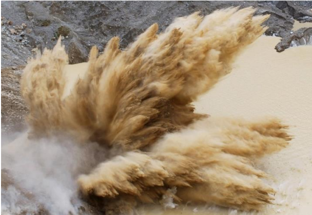
Figure 1 : Impulse wave, Grindelwald (H.R. Burgener)

Impulse waves are caused by a landslides falling inside a body of water, producing a wave on the opposite direction. Examples of such natural disasters can be found in Lituya Bay, Alaska, in 1958 where a 60 m wave was produced. In Switzerland similar events occurred in Lucerne Lake in 2007 and in Grindelwald Lake in 2009 (Figure 1).