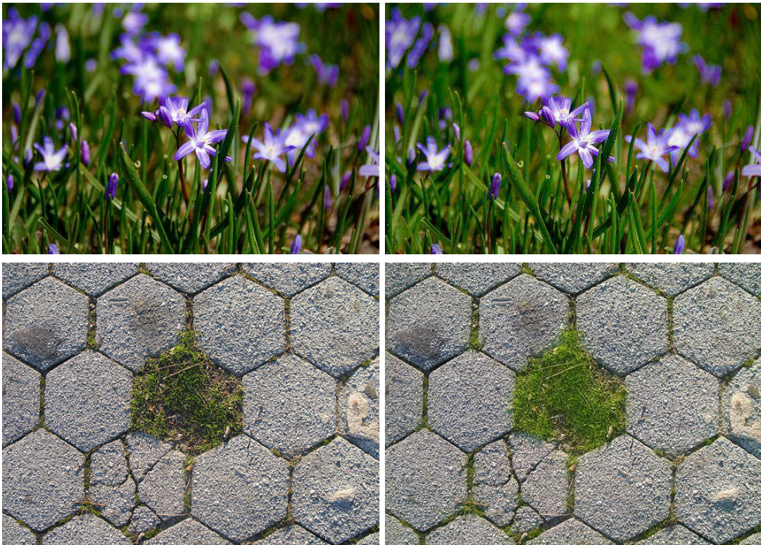
Fig. 3. grass