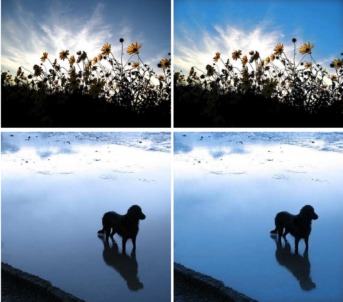
Fig. 5. sky