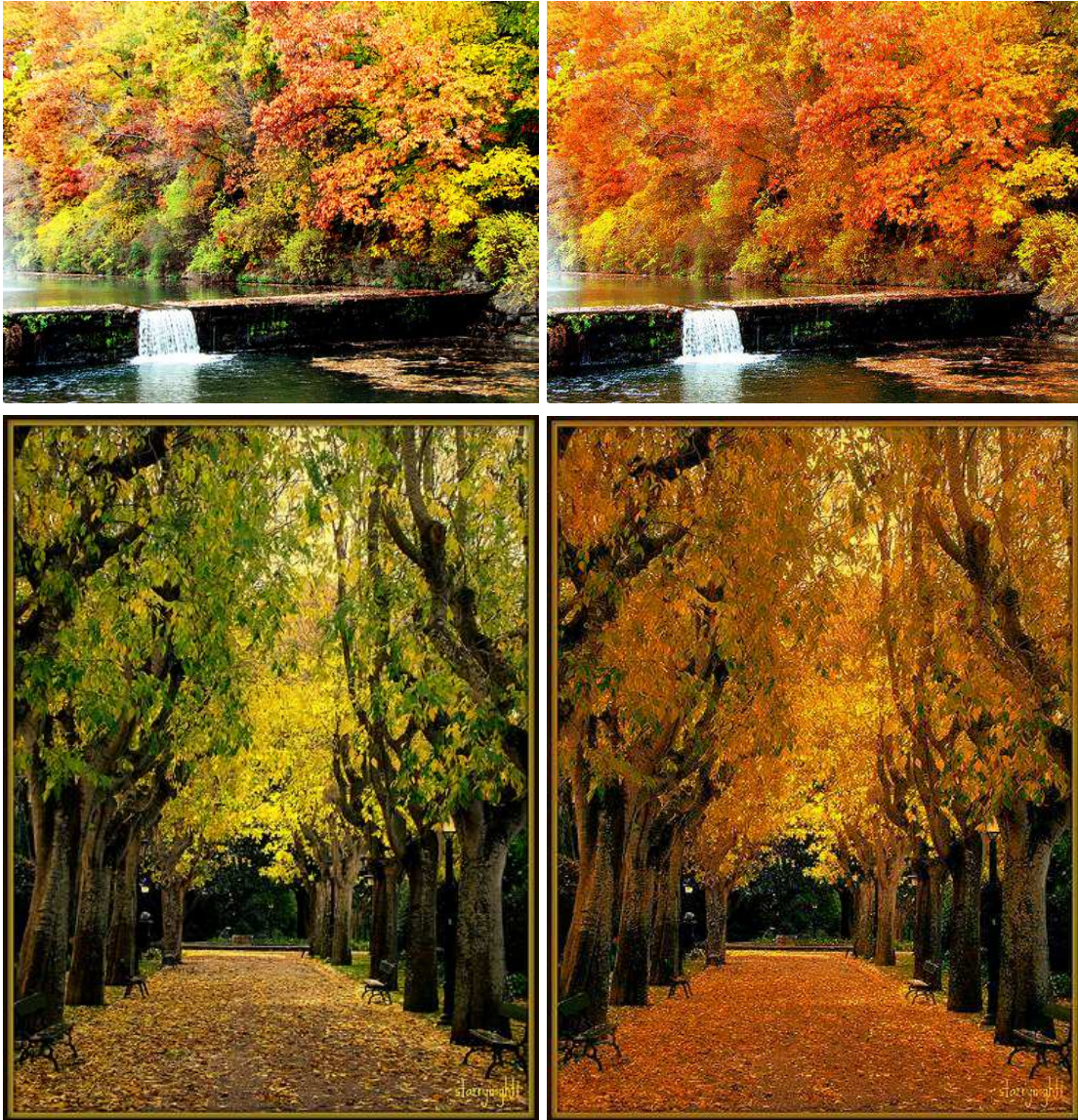
Fig. 1. autumn

Example images for semantic color re-rendering. The original input image is reproduced to the left, the enhanced image to the right hand side. The keyword is indicated in the caption.