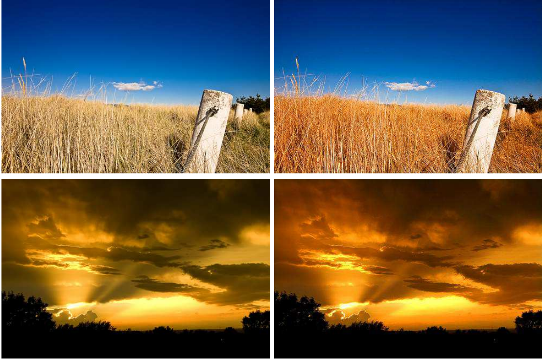
Fig. 2. gold